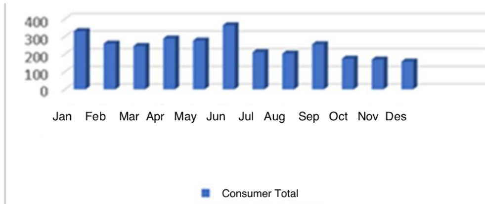
Figure 1. Number of customers of CV Sarana Utama Cargo 2021

Based on the graph, it can be concluded that the results of number of customers from January to December 2021 are decreasing, not according to what the company wants, this is due to delays in goods and service quality. Efforts made by the company to increase customer loyalty by improving service quality and minimizing delays in goods can affect customers to make long-term purchases to create customer loyalty.