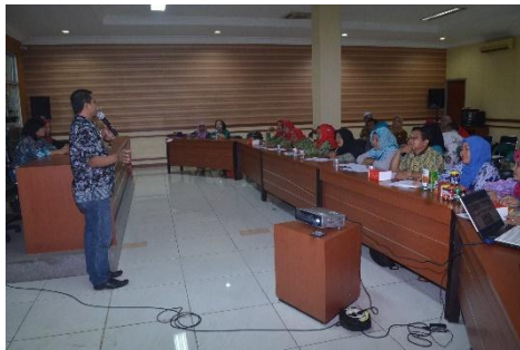
Figure 2. Implementation of Training

Most of the SME otak-otak of milkfish in Gresik Regency have obstacles in making correct financial statements, it is due to educational background and never participates in financial reporting training. So far, owners of SME cannot distinguish between business activities and personal activities, so the finances are mixed. Therefore, the Society Partnership Program Team helps SME owners in providing financial balance sheet training in collaboration with the Department of Cooperatives, SME, Industry and Trade of Gresik Regency. Implementation of the financial balance sheet training can be seen in Figure 2 below.